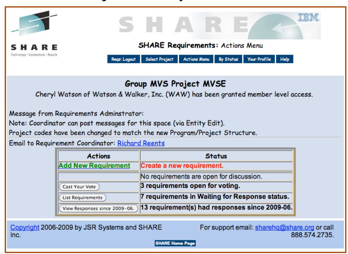
Figure 3 - MVSE Project Actions Menu

Once you select a project, you'll see a screen similar to that shown in Figure 3. This is the Actions Menu , which shows what actions you can currently take. You can see that there are no requirements open for discussion, three open for voting, and seven waiting for a response from IBM. There are also thirteen responses that have been posted since June 2009. The top line of the summary is where you would add a new requirement, which we'll discuss in the next section.