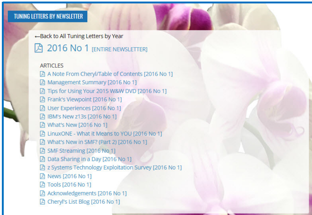
Figure 4 - Selecting a Specific Article in a Tuning Letter Issue

If you open the entire newsletter (the line that says “2016 No 1 [ENTIRE NEWSLETTER]” in the screen above), you can get to any article from the table of contents, and all hot links to figures, tables, and other pages in the document will work.